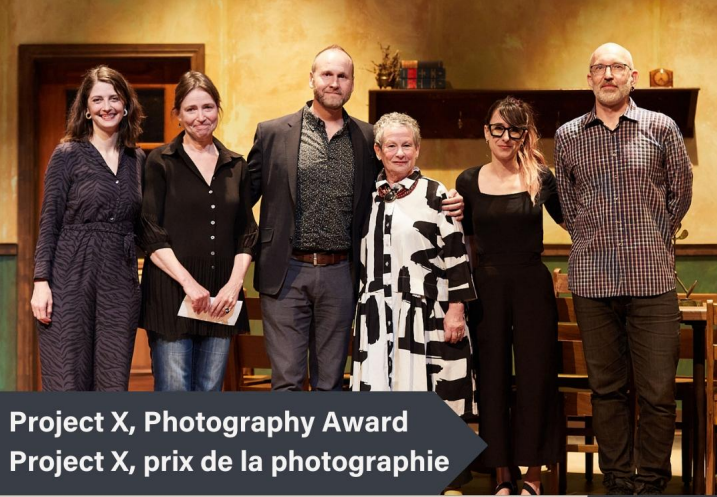
Project X, Photography Award Project X, prix de la photographie

Thank you to our sponsor and partners! Merci à notre commanditaire et partenaires!